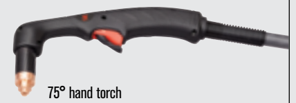
75° hand torch

(for more torch options, see www.hypertherm.com )